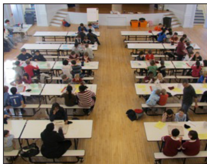
Below: A bird's-eye view of the Scrabble tournament taken from the second floor of Janney.